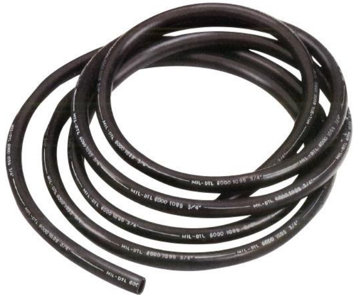
MIL DTL6000 D ® Hose